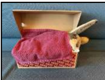
"Jack in the Box"