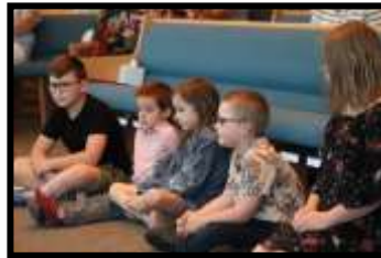
Children listening to stories about Jack!