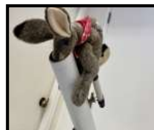
Jack riding a telescope!