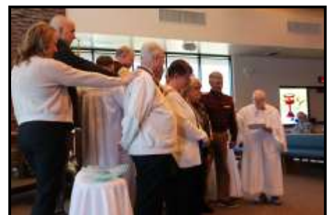
Laying on of hands