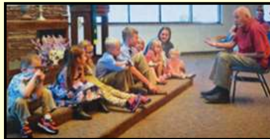
Learning the many languages God Speaks. Children's Sermon 2018