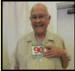
90th Birthday 2015