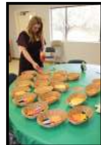
Pictures from Sunday School and the "Fall Get Together"