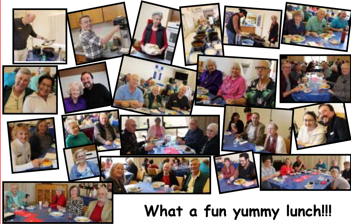
What a fun yummy lunch!!!